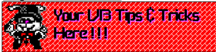
Image Control As A Button